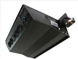
KA-400 / KK-400